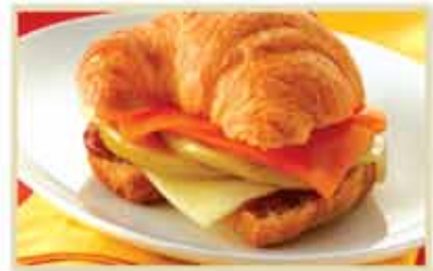
Cheddar Apple Croissant — Natural aged Cheddar Cheese, apple butter and sliced Granny Smith apples on a buttery croissant