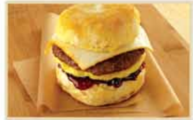
Blueberry Sausage Melt — Natural Muenster Cheese, blueberry patty and scrambled eggs on a country biscuit

Converting a breakfast sandwich, or your entire breakfast menu, is made easy by tapping into Sargento slicing technology and wide assortment of unique artisan cheeses. Here are a few ideas to get you started: